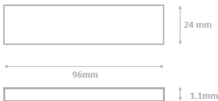
Dimensions stated in mm Supply format = 500 labels per roll