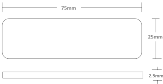
Dimensions stated in mm