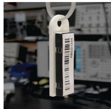
A white printable label will replace the standard black label when a printable label is required.

Omni-ID office locations: US | UK | China | India | Germany For product or technology inquiries email: sales@omni-id.com