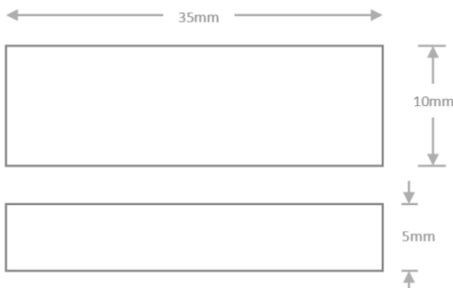
Dimensions stated in mm